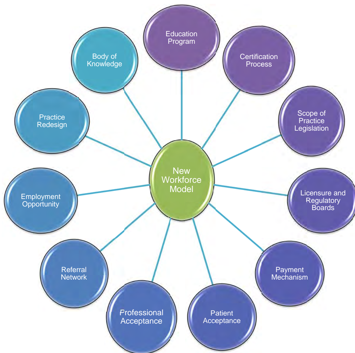
Figure 1. Components Necessary to Establish New Oral Health Workforce Models